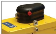
Several antenna options