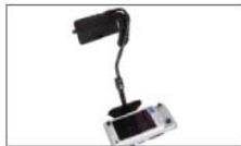
Optional shoulder harness