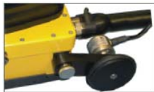
Several encoder options