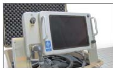
Adjustable viewing angle