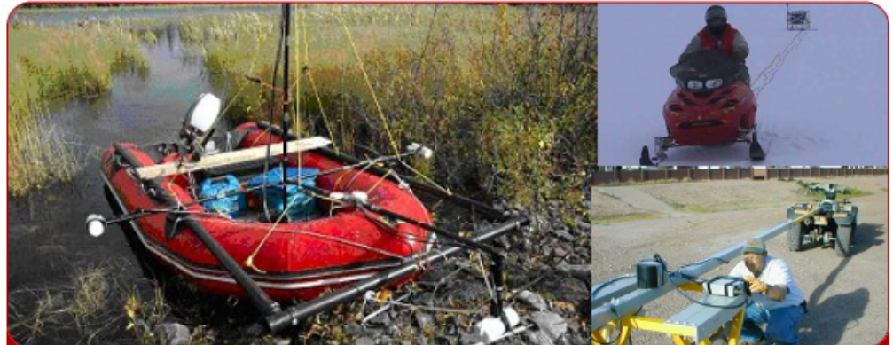
Multi-sensor configurations can be implemented on various platforms. These platforms take advantage of GEM's 4-channel "true simultaneous" capabilities

GEM Leadership and Success in the World of Magnetics is your key to success in applications from Archaeology, Volcanology and UXO detection to Exploration and Magnetic observation Globally.