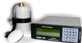
GSM-19T Proton Magnetometer The Proton Magnetometer from GEM provides a reliable, robust affordable survey solution.

This GEM GSM-19T provides excellent sensitivity for many applications in most environments. (.15nT @ 1 reading per sec).