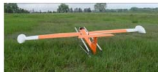
Just before launch

Regulations vary for different jurisdictions. Since the Airframe has a maximum takeoff weight in a range between 2 kg and 25 kg, as of Nov 2014 Transport Canada will issue to operators an exemption to the requirement to obtain a Special Flight Operating Certificate (SFOC) for a UAV flight. The Tempest airframe has more Certificates of Authorization (COA's) issued by the FAA in the USA than any other commercially available UAV platform. In Ontario, Canada the complete system was flown under SFOC.