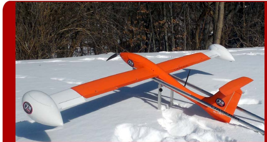
The autonomous GEM MONARCH gradiometer system on its launcher

Our Leadership and Success in the World of Magnetics is your key to success in applications from Archeology, Volcanology and UXO detection to Exploration and Magnetic observation Globally.