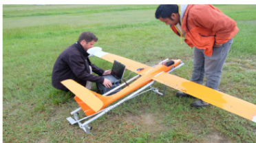
Preparation for launch